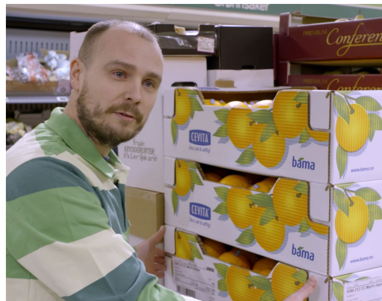
Ergonomic working height with pallets measuring only 120 cm tall.