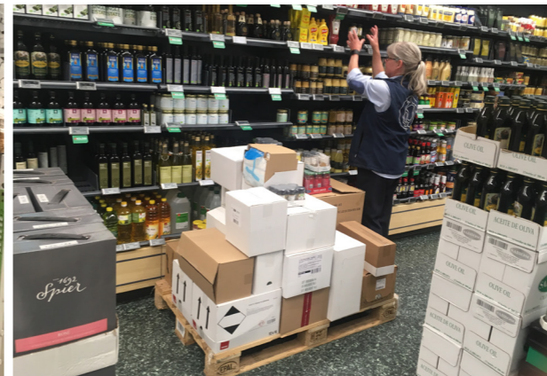
All pallets delivered in best working height for retail personel