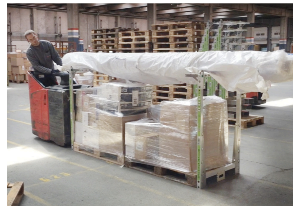
SpaceInvader in use with long goods