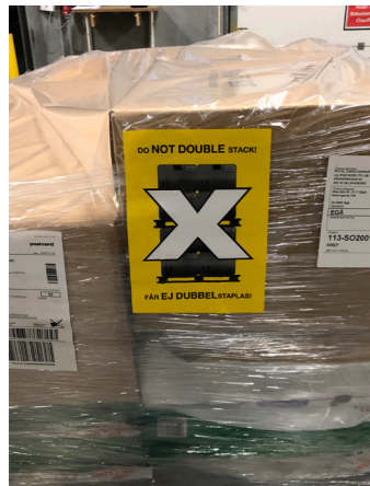
No more unstackable goods