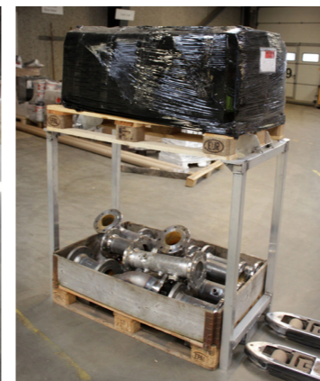
SpaceInvader stacks goods otherwise unstackable