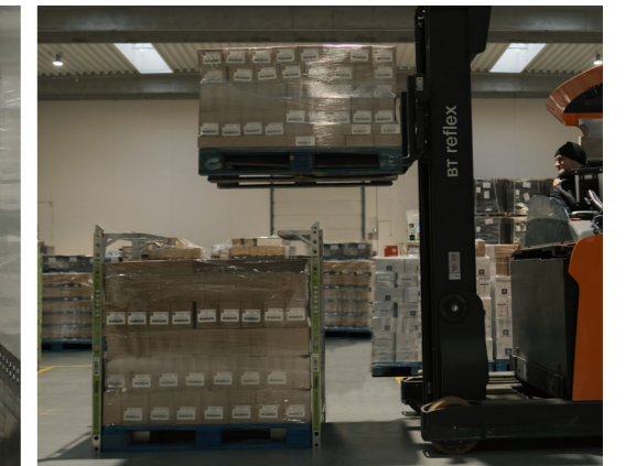
SpaceInvader double stacks loaded pallets that otherwise are unstackable