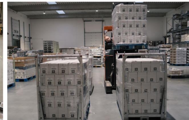
SpaceInvader used as temporary shelving unit