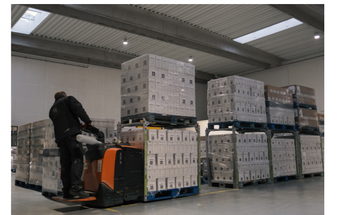
SpaceInvader ready in loading area