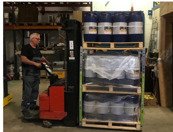
SpaceInvader secures transport of high loaded pallets

SpaceInvader can be used to solve warehousing needs and in a retail environment. The rack is a flexible storage solution for quick and easy movement pallets, as well as storing semi-finished items during the production process. In retail, double stacking pallets makes for a more efficient and ergonomic replenishment of stock, as well as optimised storage space.