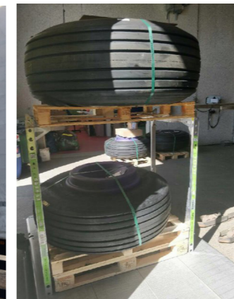
SpaceInvader stacks goods otherwise unstackable