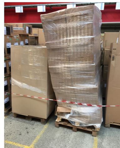
No more breakage