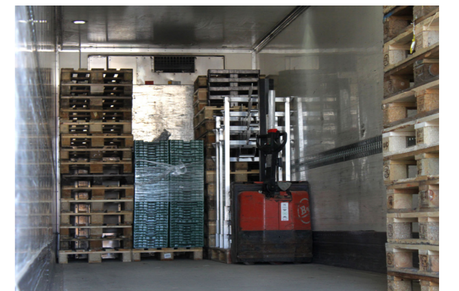
SpaceInvader stacked return