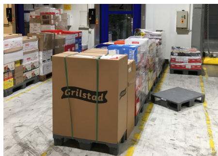
No more low pallets that take up space on the floor and in transport