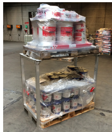
SpaceInvader stacks goods otherwise unstackable