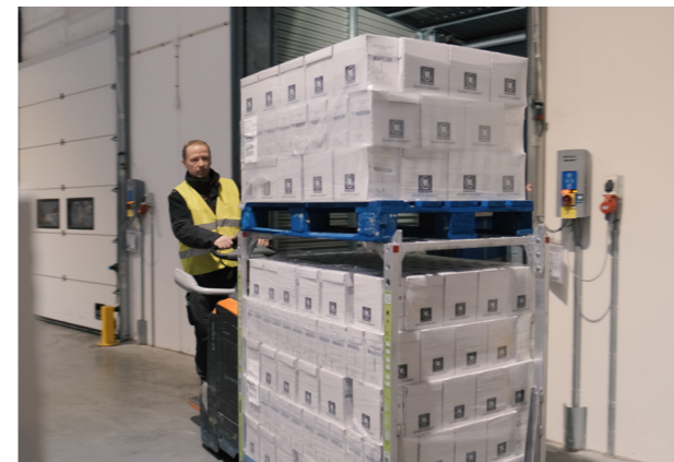
Fast and efficient loading and unloading