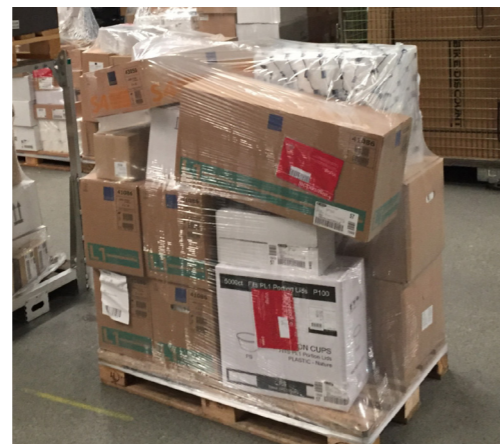
No more low pallet heights