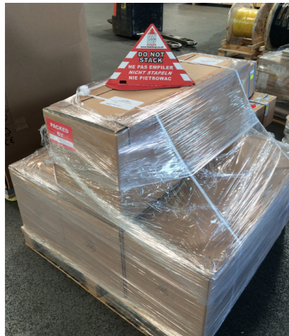
No more unstackable goods

Cargo comes in many shapes and sizes. A lot of it, as shown below, can be stacked better and more securely with SpaceInvader. The pallet rack protects fragile and unsecured cargo by dividing and double stacking it. That means reduced breakage during transportation and in storage, as well as more efficient loading and unloading of trucks.