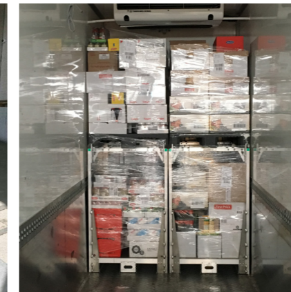
SpaceInvader optimises longitudinal cold storage