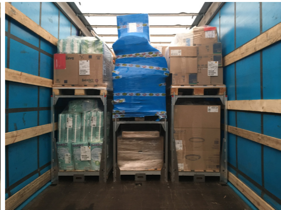
SpaceInvader optimizes various pallet heights. Here is seen pallet heights of 80 120 160 cm.