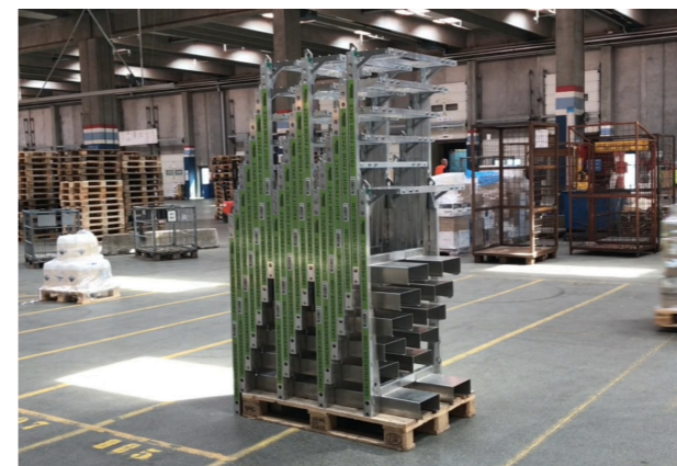
Stack 20 SpaceInvader racks on one pallet