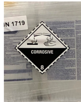
SpaceInvader stacks goods otherwise unstackable