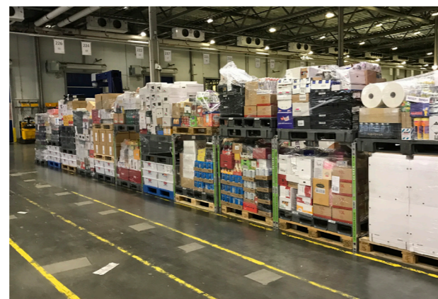
SpaceInvader ready in loading area