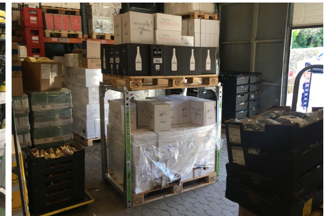
Optimising retail storage