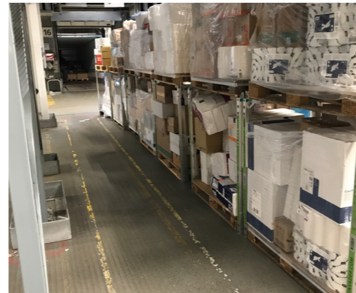
SpaceInvader ready in loading area