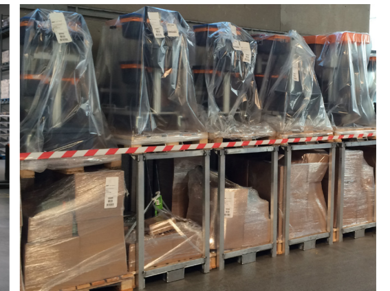
SpaceInvader used as temporary shelving unit