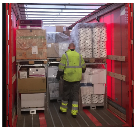
SpaceInvader in use – transport fully loaded