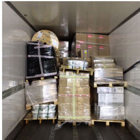
No more time-consuming loading, unloading and breakage during transportation