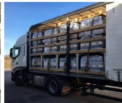
SpaceInvader in use – transport fully loaded