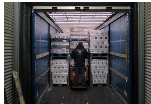
SpaceInvader in use – transport fully loaded

From packing shipments on the loading dock to its return by truck, SpaceInvader is effective for optimising your supply chain through double stacking of pallets. Take a look at how the rack can be used for stacking goods, how it fits in the truck and how it is stacked when not in use.