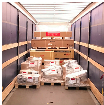
No more empty space on transport