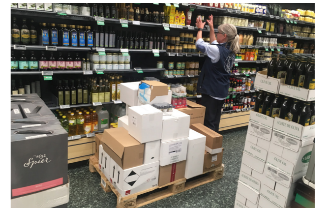
All pallets delivered in best working height for retail personnel