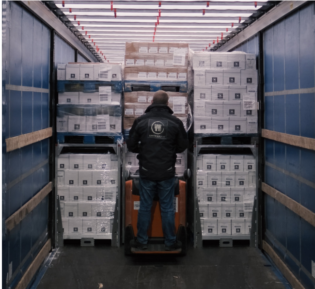
SpacInvader in action