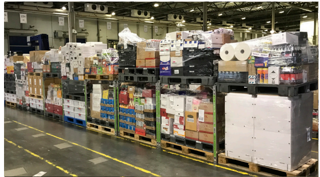
Double stacked pallets packed and ready for truck loading.

The industry competes on its ability to be more efficient. The SpaceInvader pallet rack increases your efficiency on both the production floor and during transport. With the rack you can stack odd-sized and fragile goods in two layers. You become more efficient in your temporary storage of both finished and semi-finished products when you optimise the use of your floor- and storage space, and the same applies during transport.