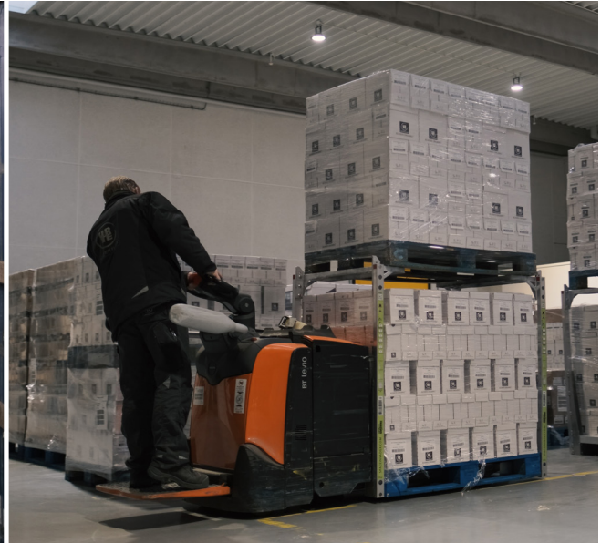
This is what profit from space looks like

In logistics, many operators have the same strategic priorities whenever they send a truck out for delivery: for the truck to be as fully loaded as possible, and to achieve the best bottom line for every trip. Two other highly ranking strategic factors are: a) the impact each trip has on the working environment in the supply chain and b) the environmental footprint.