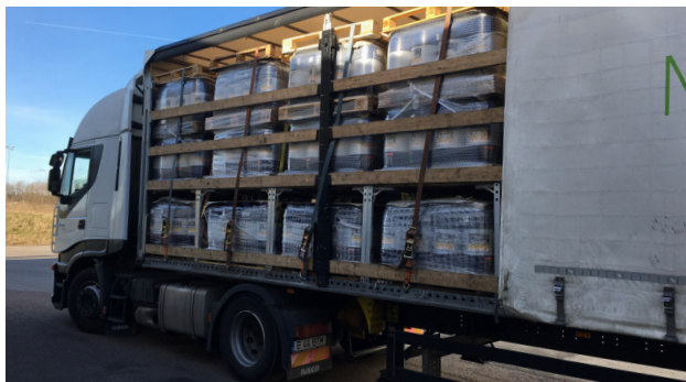
Double stacked pallets increase the truck filling capacity significantly

With double stacked goods you avoid the daily puzzle of figuring out how to best fill your truck, because the pallet rack makes it easier to handle and pack non-uniform goods. SpaceInvader simultaneously protects fragile and odd-sized goods and creates more floor space. When you take advantage of that empty room above and stack vertically, you can fit more on the same truck. It is also possible to place excess-length goods along the top shelf of the racks.