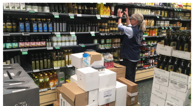
Lower packed pallets - 120 cm - improves the working height and ergonomics in the store.

Pallets packed high, up to 180 cm, are difficult to handle in a retail environment. With SpaceInvader you win space when you double stack two pallets of 120 cm, which combine to 240 cm of transport height. It makes it easier for freight companies to deliver goods packed according to zone and category. You also win time during unpacking and improve your ergonomics during replenishment of stock due to the new lower working height. Finally, with double stacked deliveries you will get more goods with every shipment.